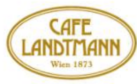
Picture: Cooperation partners of Riding Dinner.