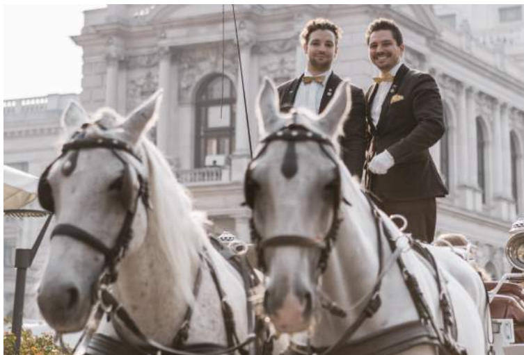
Picture: We are looking forward to be your special Vienna experience.