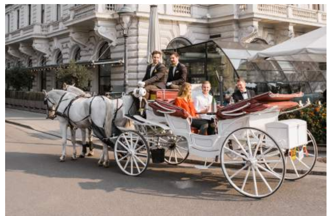
Picture: enjoy the served food & beverages comfortably in our “rolling restaurant”.